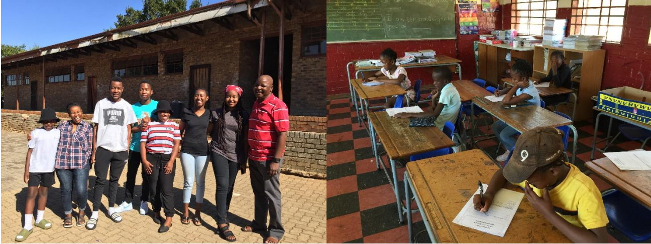
YOSA team running weekend classes in January