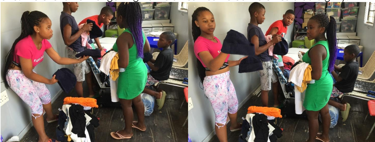
Clothes distribution to our youths and children