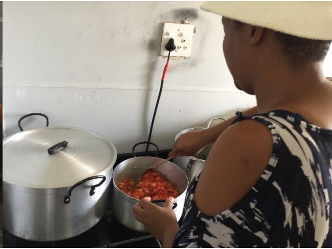
Grannies conducting their meeting and staff preparing their day's meal