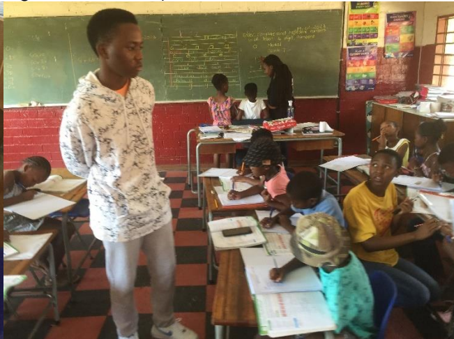
Maths mentorship for grade four class by university students