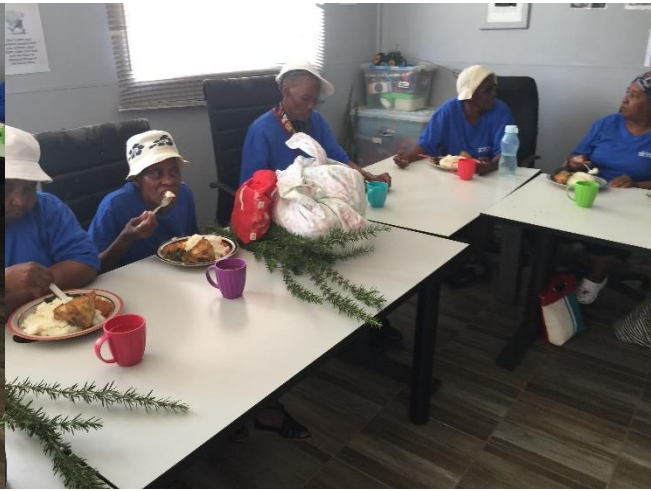
Grannies sharing information and discussing the benefits of herbs like Rosemary, Sage, basil, chives and others.