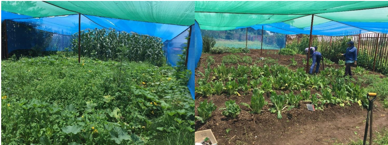
YOSA volunteer gardeners at work

Our academic year has started well. The opening of schools has brought back our learners, now at different levels, calling for different level of programming. We have had lots of rains and our garden was overgrown. All staff have been on holiday are coming back slowly. Our grannies' support group and academic support programme started well. We have had fewer, but effective international visitors during the month of January.