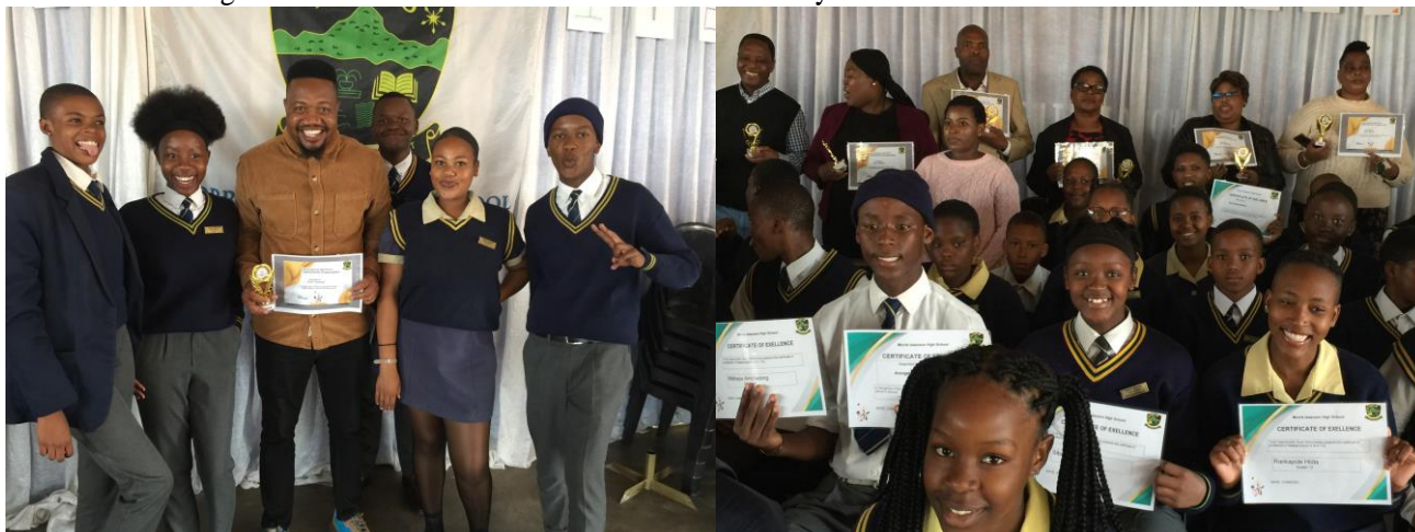
The awards displays were very inspirational for the whole school. The school's attitudes towards passing have shifted positively.