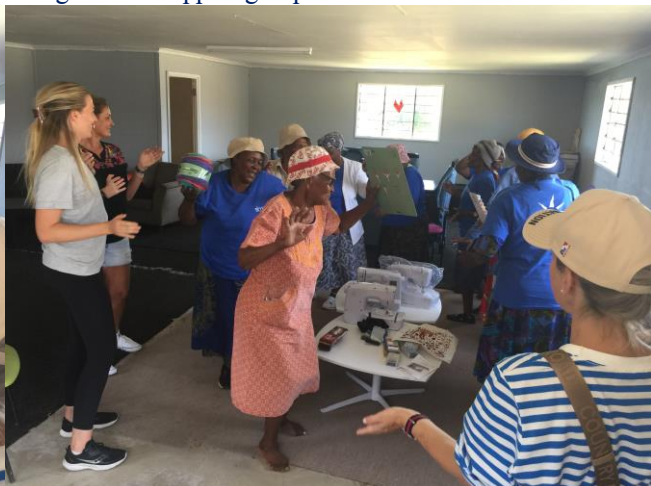
Grannies broke into song and dance after receiving the sewing machines.

It's hard enough parenting for the first time. It is even harder for these grannies who are parent for the second time. They lack resources and some of them, their health is failing them, yet they are caring for school-going grandchildren. The sewing and knitting activities have rejuvenated them. Most of them are learning these skills and using this opportunity to provide clothes for children during winter and improving their household incomes.