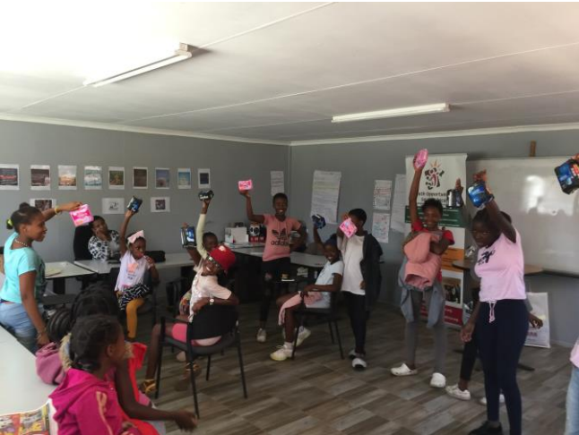
YOSA social workers and learners celebrating their friendly donations.