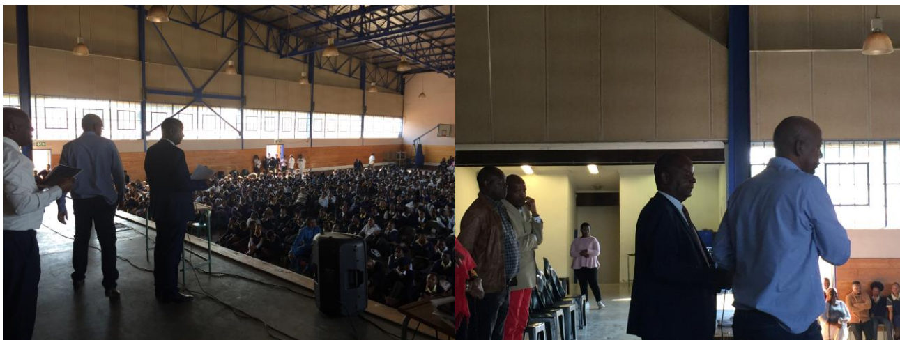
Educators receiving their awards for the first time in memorable history.