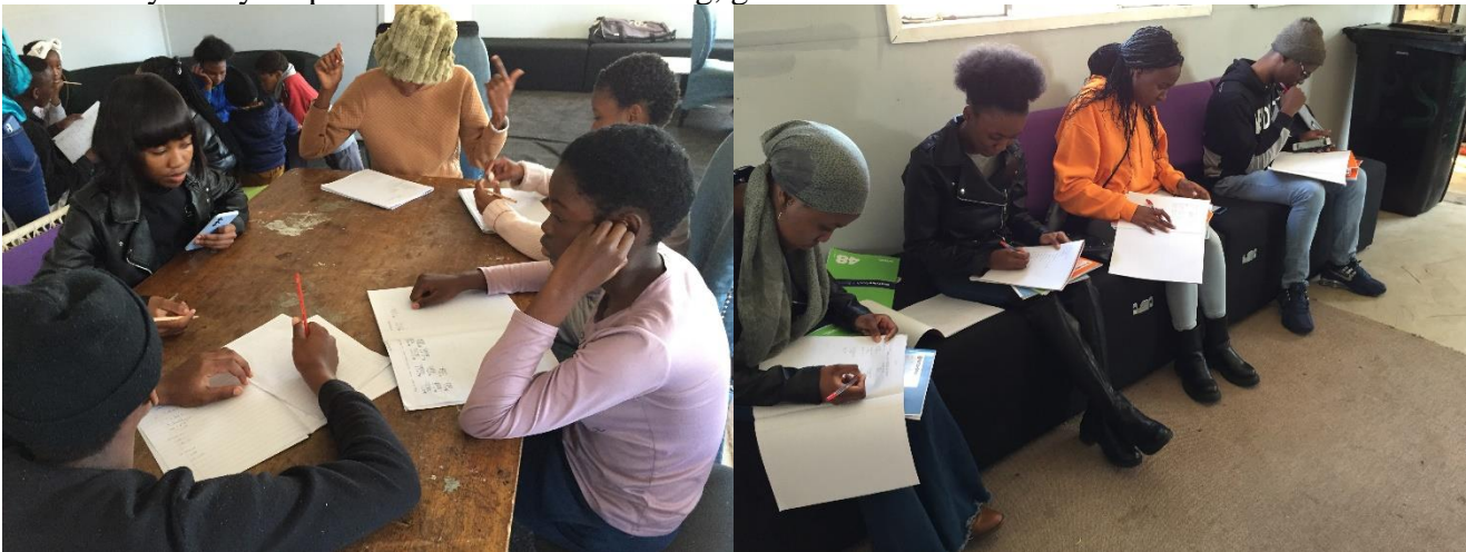
Curriculum coaching for learners and university students marking children's work.

The holiday programme progressed as planned. There was tremendous support from the four YOSA graduates who are currently in universities. These young people attended our programme to give back to YOSA and the community. They helped with academic coaching, games as well as motivation for learners.