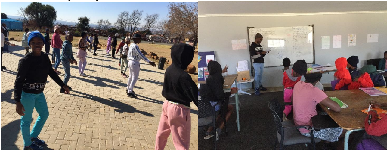
School holidays' Centre based activities.

The month of July saw further development of our digital literacy programme with learners learning coding and website building. The gamers have also entered a new season and our learners are excelling in their categories. Our Merit Awards programme in primary and secondary school has gained momentum in motivating learners. With the end of the cold season our garden project is progressing beyond feeding our beneficiaries to selling excess produce.