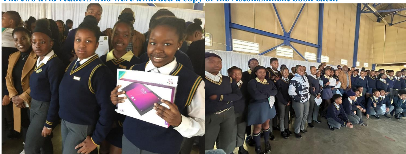
Learners who excelled in digital literacy received tablets, cell phones and watches.