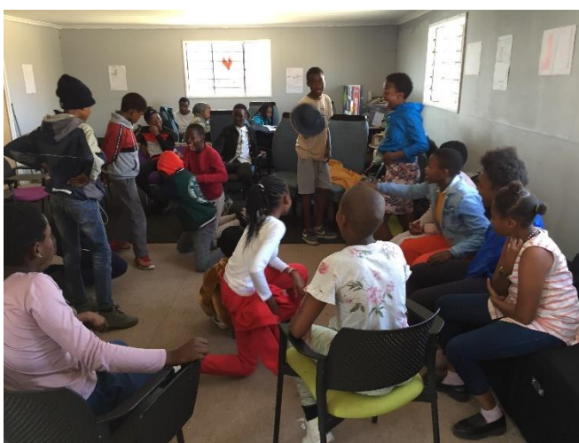
School based and Centre based curriculum coaching activities.