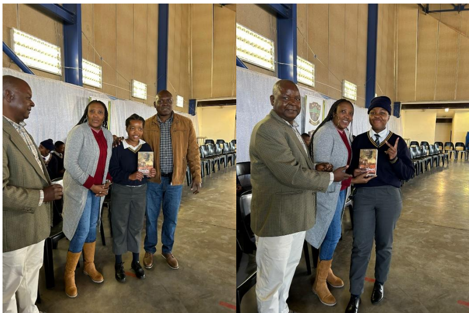
The two avid readers who were awarded a copy of the Astonishment book each.