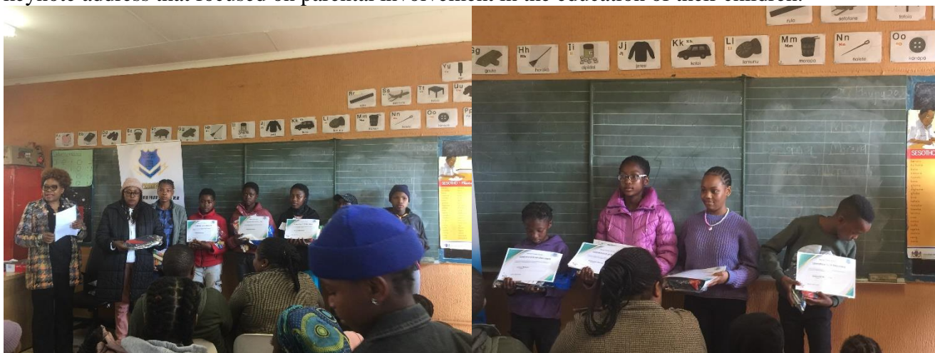
The principal and some of the learners who received prizes on the day.