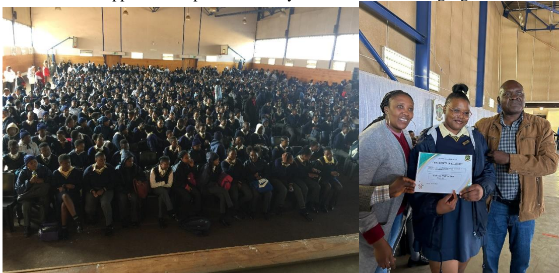
Learners are seated in the hall and some on stage to receive awards.

The number of learners in high school who received awards for attaining marks of 70% and above per subject was 127, up from 94 in the first term. Motivation through awarding prizes to learners for their effort is in line with our Positive Youth Development approach. It is proving to be an effective and efficient way of maintaining discipline and learners' focus on education. Learners received certificates and badges for every subject passed with 70% or better. They received tablets, cell phones and watches for digital literacy credits. We continue to appeal to our partners for any useable second-hand gadgets for learners' motivation.