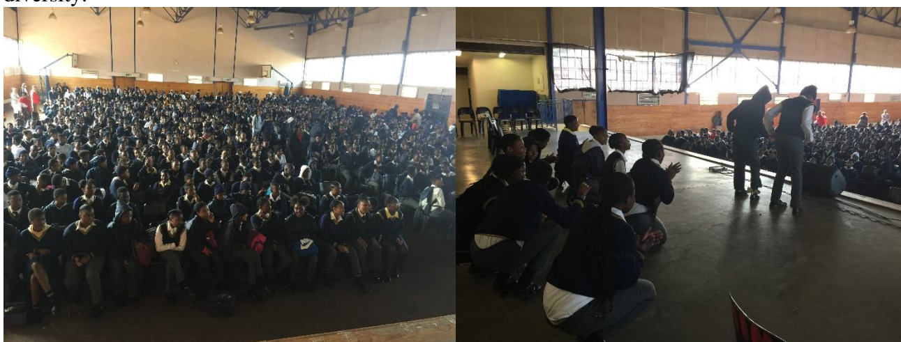
Learners entertain the whole school through cultural music and dances.

In August we held cultural concerts for learners in high school. Learners made speeches about their cultures followed by different cultural groups presenting their music and dance to the whole school during the afterschool programme. This has helped to build cohesion among the learners and educators as well as promote unity in diversity.