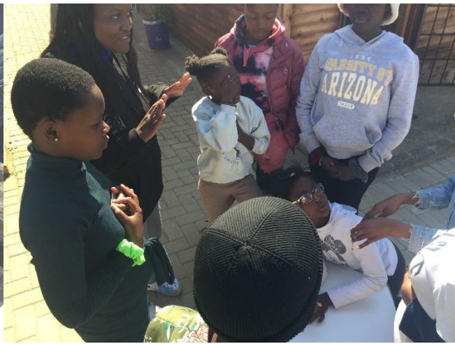
The Centre is about playing games, sports and Learning: keeping the young minds alive and thinking.