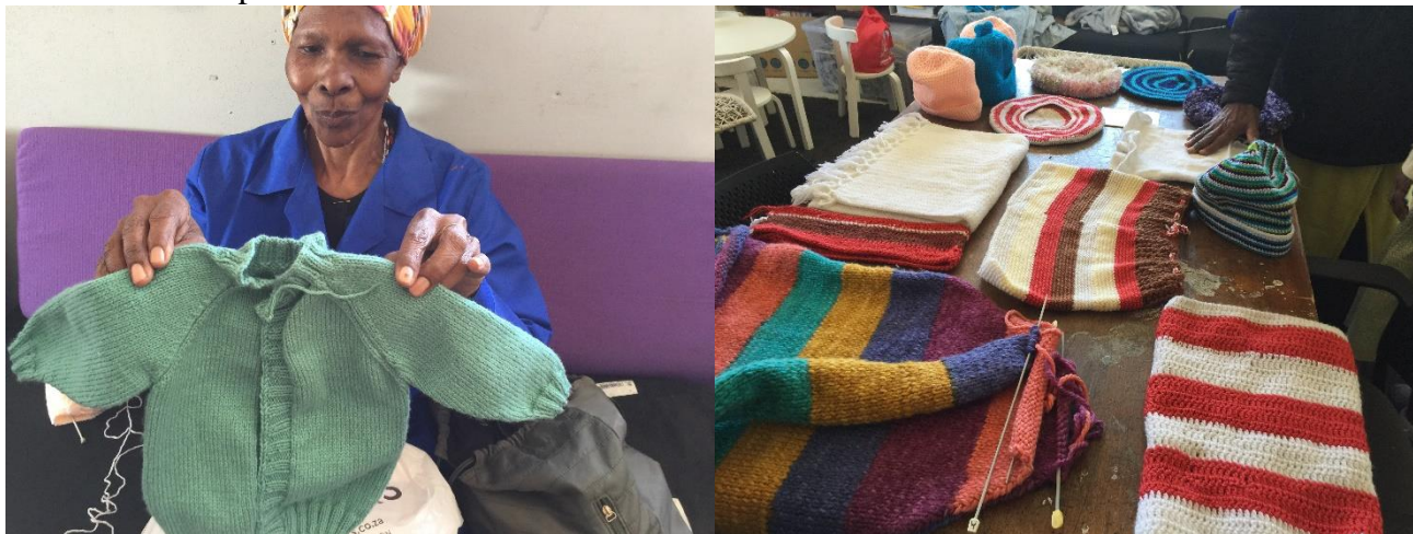
Grannies displaying their knitted products.