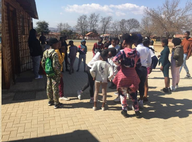
Holiday and afterschool activities