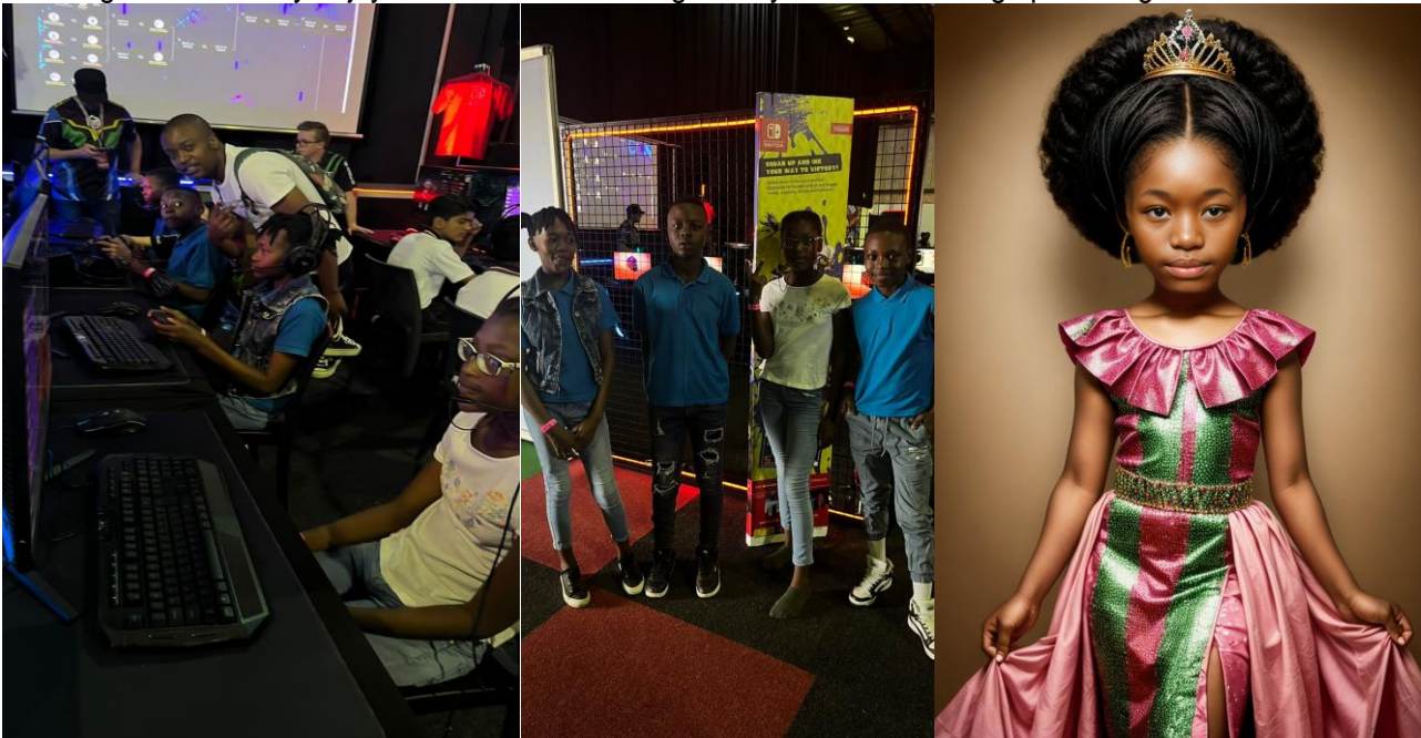
The learners enjoying their AI depiction of their possible futuristic transformation.

YOSA is very grateful to Vivian and Scadco for exposing our learners to computer gaming and the prestigious tournament that included a lot of other Minecraft education. The learners were exposed to mind-blowing generative AI. The contest was attended by a lot of upmarket schools and ours were the only team from the township community. Our learners were excited to win some of their games and they enjoyed the cultural exchange. They are fast catching up with digital innovation!