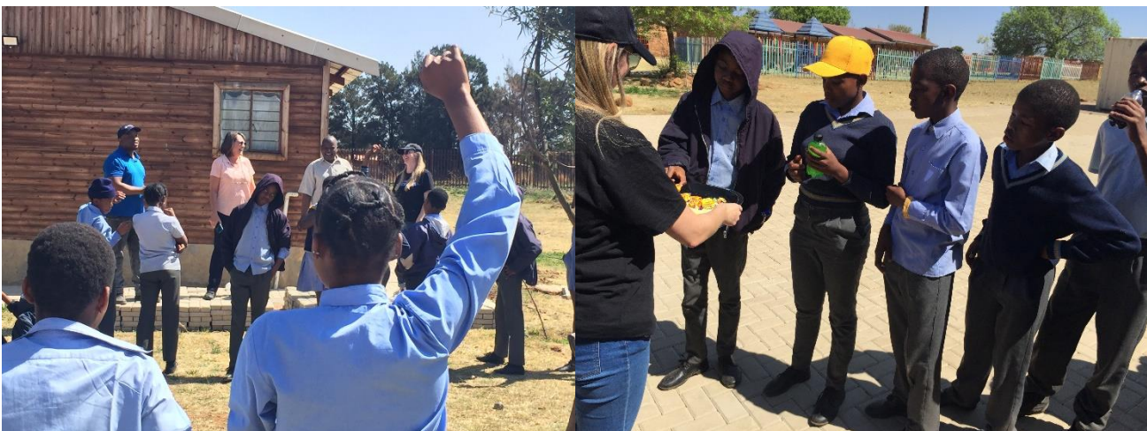
Microsoft staff addressing learners and later sharing snacks and drinks.