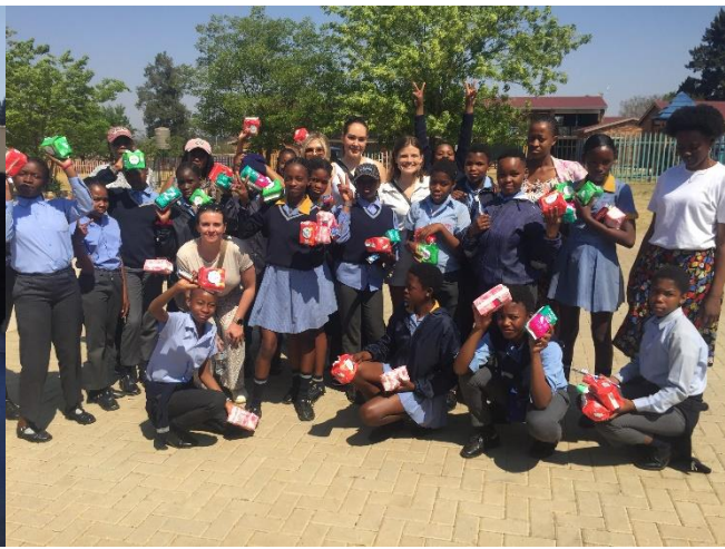
Girls, performing for our visitors after receiving their dignity packs.