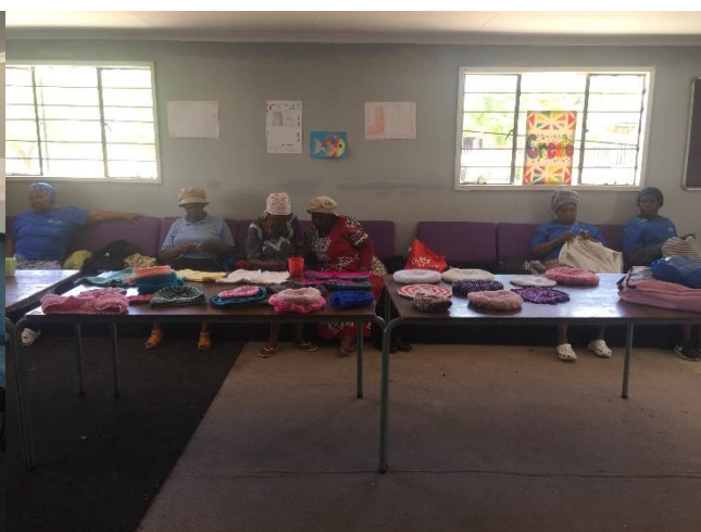
Grannies, cutting materials for sewing and displaying their knitted items.